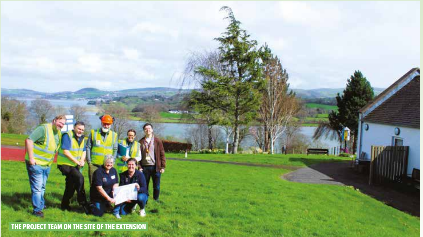
THE PROJECT TEAM ON THE SITE OF THE EXTENSION

Work is about to begin on an extension to Tŷ Gobaith to create a bespoke suite where children can be nursed at the end of their lives, and their families can be looked after too.